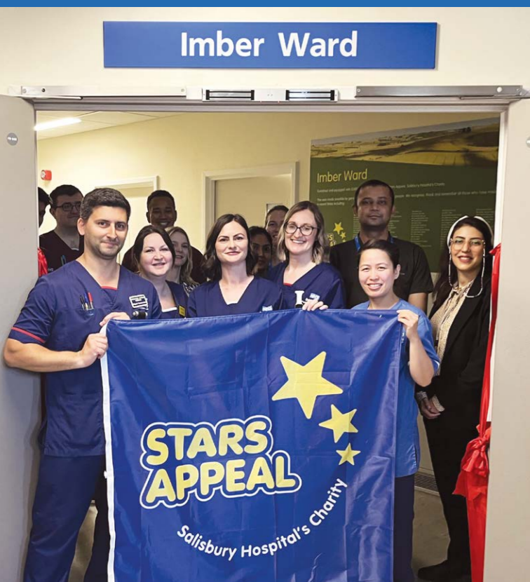
▲ Staff celebrate the opening of Imber Ward

The Hospital's new 'Imber' Ward opened in June, providing care for older patients in a modern, purpose-designed building.