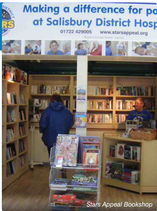
Stars Appeal Bookshop