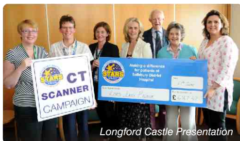
Longford Castle Presentation