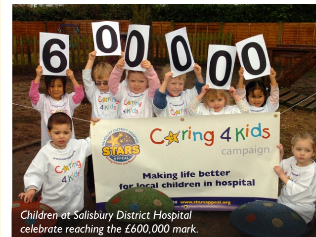
Children at Salisbury District Hospital celebrate reaching the £600,000 mark.