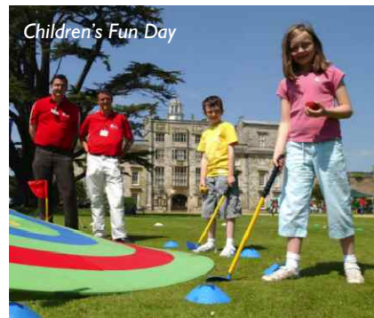
Children's Fun Day

Over 5,000 people enjoyed the sun and beautiful grounds at Wilton House at the Children's Fun Day in June. Entertainment from E-Minor, Ticklish Allsorts and the Little Red Bus to name just a few kept the crowds amused between the duck races.