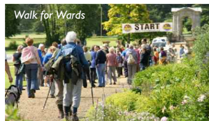
Walk for Wards

This year's Tidworth 10k & 3k Fun Run saw 1,000 people run the fantastic new routes, starting and finishing at Tedworth House.