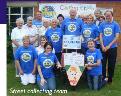
Street collecting team