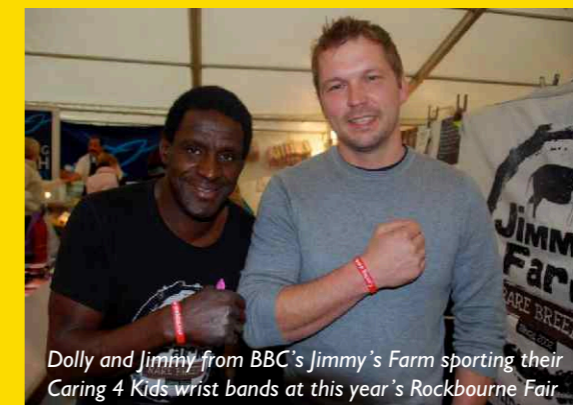
Dolly and Jimmy from BBC's Jimmy's Farm sporting their Caring 4 Kids wrist bands at this year's Rockbourne Fair