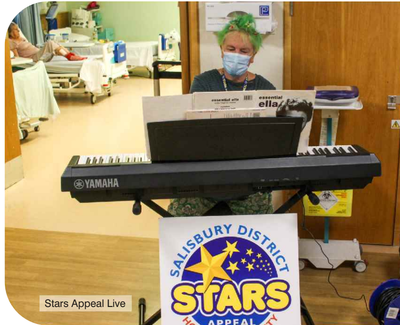
Stars Appeal Live