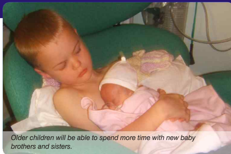
Older children will be able to spend more time with new baby brothers and sisters.

They are helping to raise the £350,000 needed to create a place where parents and siblings can stay close to their babies born too sick, too small or too soon. The Family Accommodation Unit will cater for up to six families at a time when it opens in 2012, and will connect directly to the new larger NICU. Watch our video at starsappeal.org to see parents talking about the need for the project.