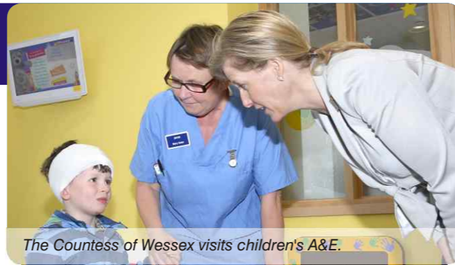
The Countess of Wessex visits children's A&E.

This separate waiting, assessment and treatment area for children will open later this summer, ready to welcome the 9,000 children treated by A&E staff at Salisbury District Hospital each year.