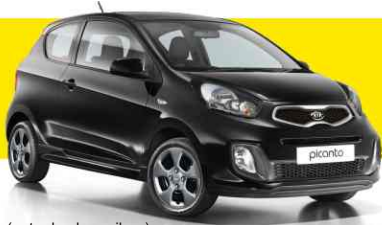
(actual colour silver)