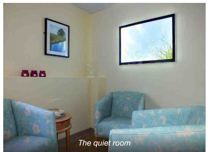
The quiet room