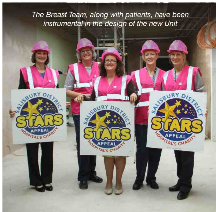
The Breast Team, along with patients, have been instrumental in the design of the new Unit

Meanwhile, we're aiming to raise £25,000 each year to support patients using the new Unit, so please keep supporting our Breast Unit fund – thank you.