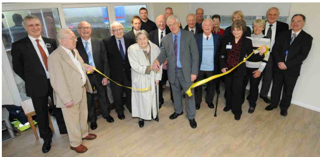
The official opening of the refurbished bungalows

Each bungalow has a fully fitted kitchen, lounge and six en-suite twin bedrooms, which are available 24 hours a day. They were officially reopened at a special ceremony in January.