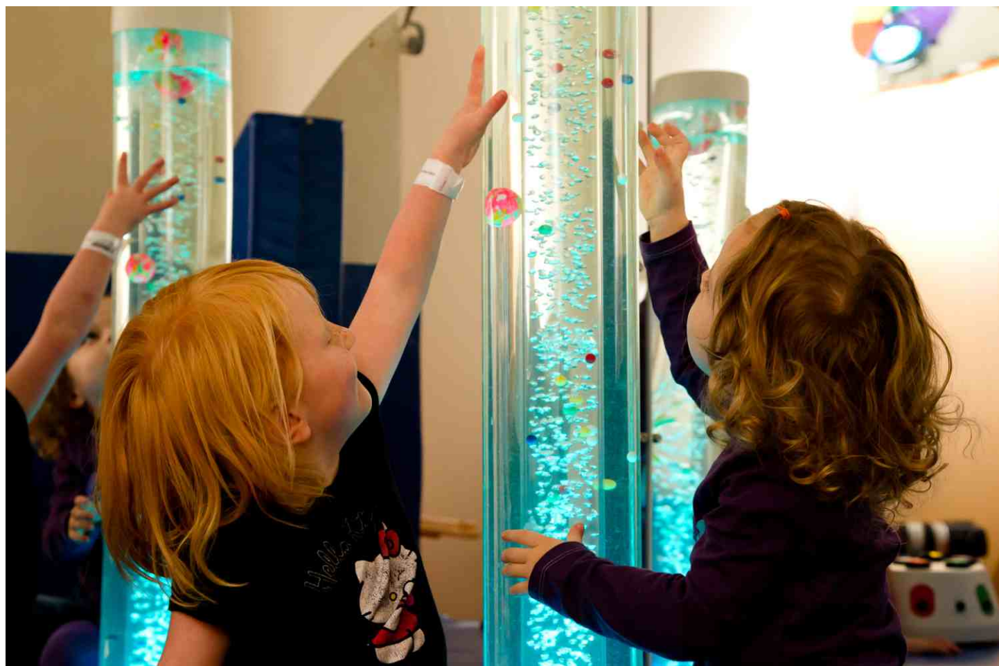
Children love the fun and friendly environment in the Children's Unit