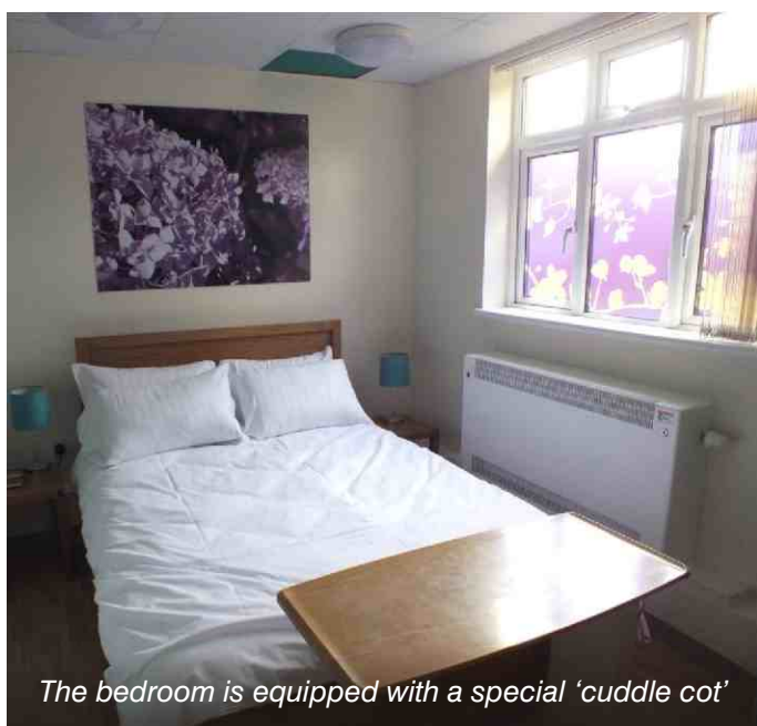
The bedroom is equipped with a special 'cuddle cot'