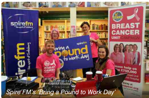
Spire FM's 'Bring a Pound to Work Day'