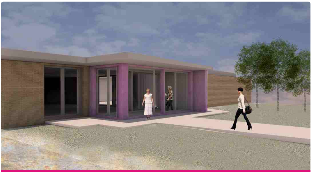
How the new Breast Unit could look

The new Unit will feature purpose-built waiting, diagnostic, treatment and counselling rooms dedicated entirely to breast patients. And thanks to the increased space, and availability of state-of-the-art equipment, patients attending for tests to see if they have breast cancer will receive their diagnosis on the same day, avoiding anxious waits for results.