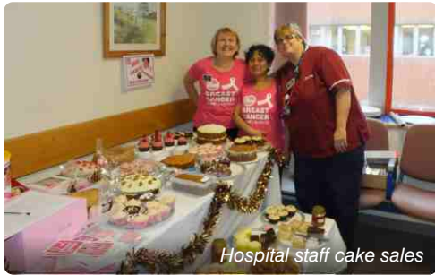
Hospital staff cake sales