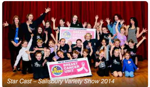
Star Cast – Salisbury Variety Show 2014