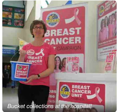
Bucket collections at the hospital!