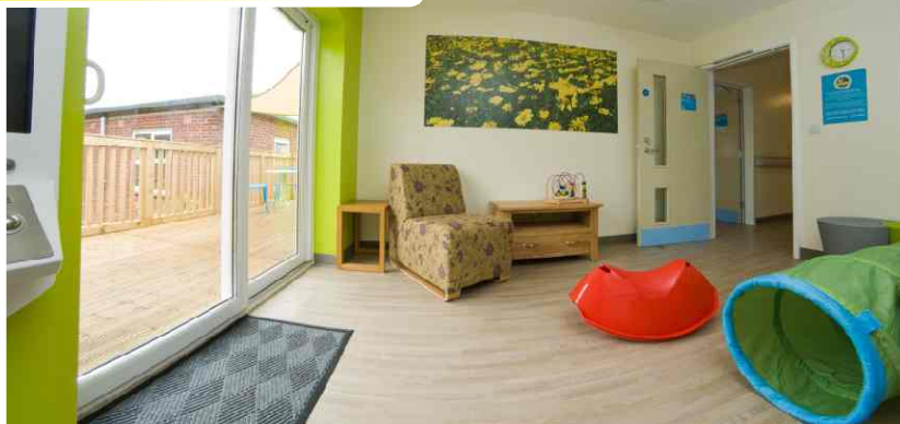
Siblings can let off steam in the playroom

President of the Stars Appeal, who spent time on the Neonatal Unit as a baby.