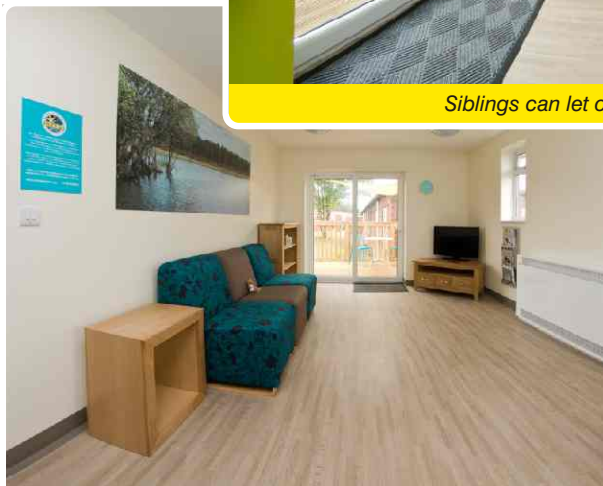
Parents can relax in the lounge

"We are hugely excited about the Unit, especially the facilities for parents which will make such a difference to the families we care for and, thanks to Stars Appeal supporters, will be amongst the best anywhere in the country!"