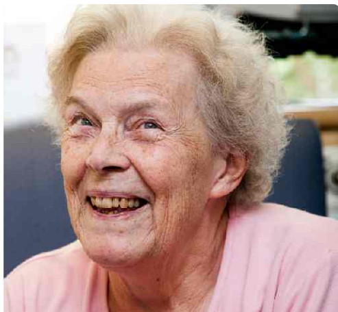
Young at Heart helps older patients get well sooner